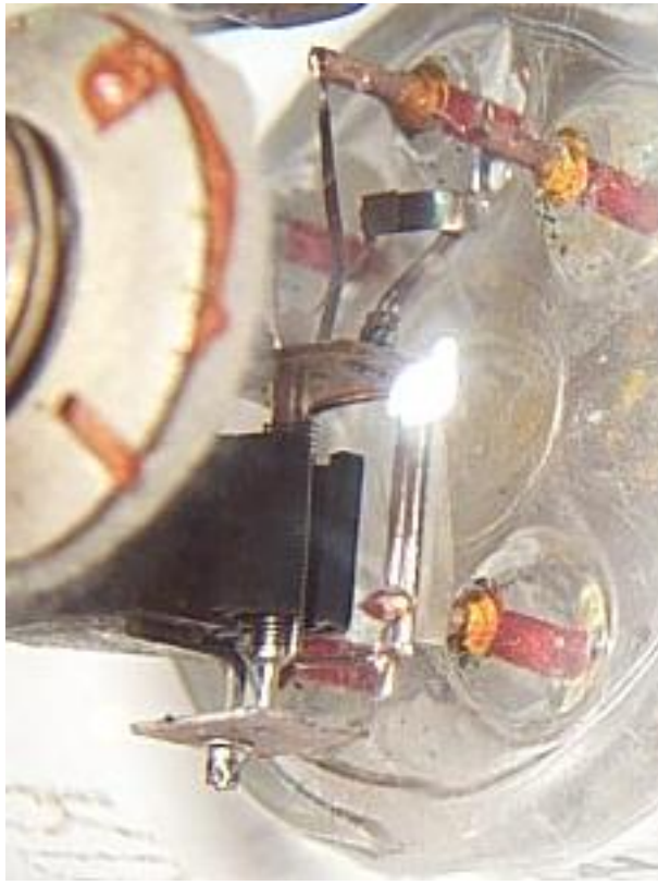
RC5B internal, left, and RD12Ta, right