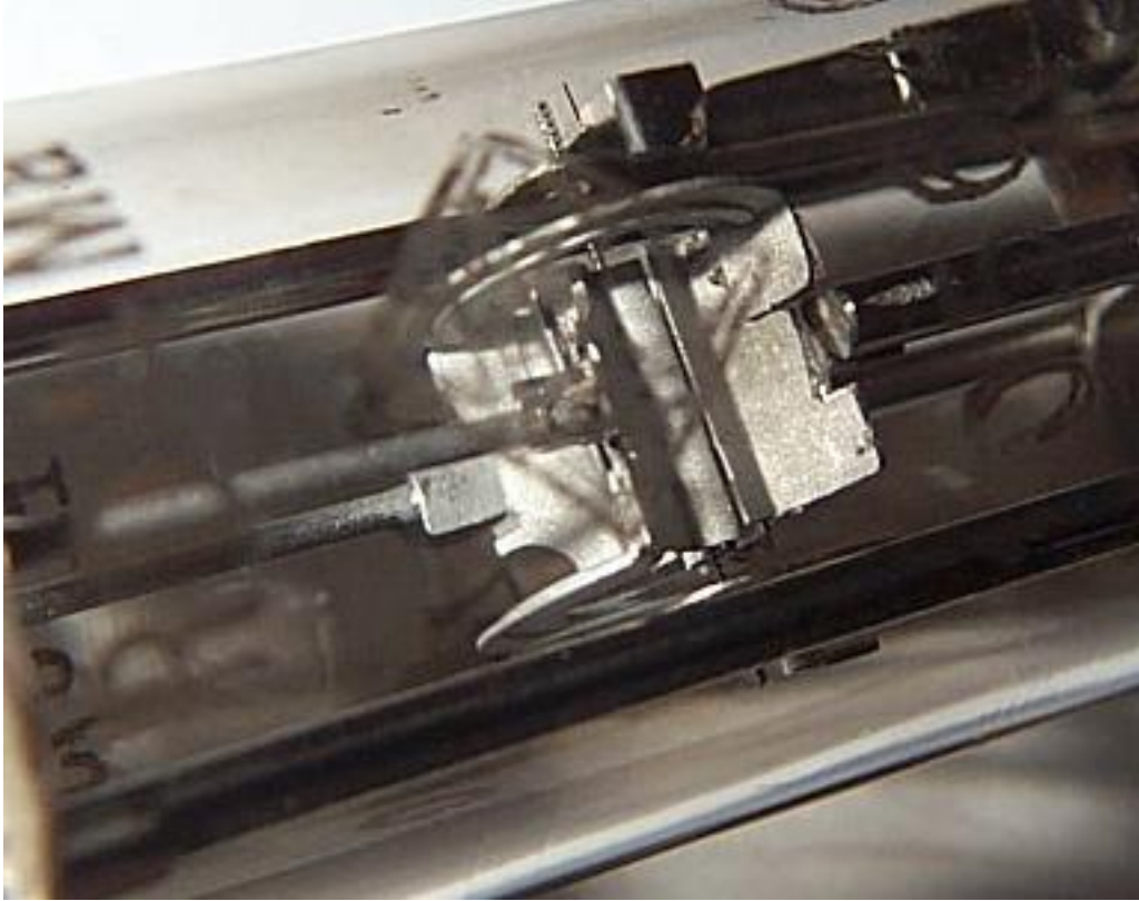
This magnetron is a split anode device, the anode being in 4 segments with opposite segments connected together.